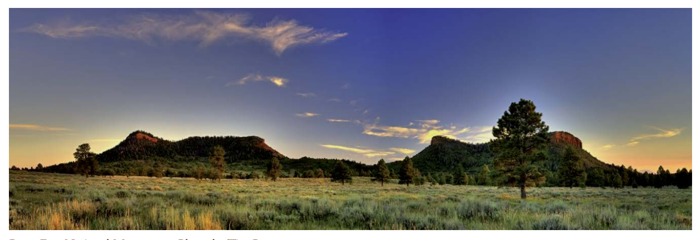
Bears Ears National Monument.