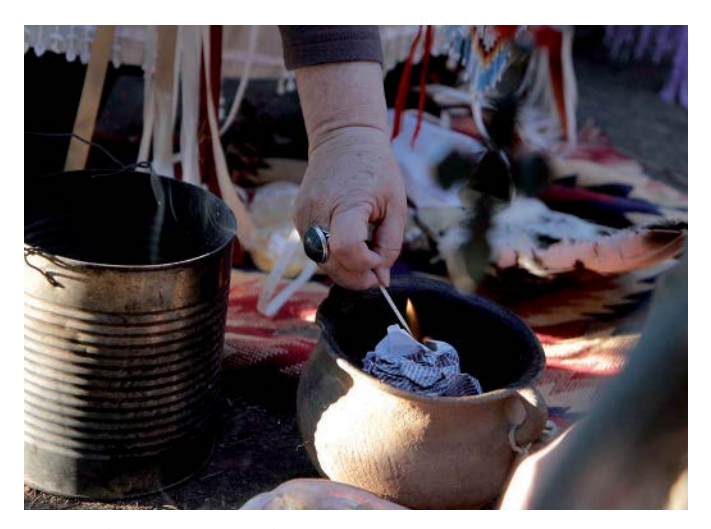
Copy of the Doctrine of Discovery being burned during the clergy march on Standing Rock.

In 2016, the Standing Rock Sioux Tribe galvanized an unprecedented movement for solidarity to protect their sacred land when Energy Transfer Partners undertook construction of the Dakota Access Pipeline. The Dakota Access Pipeline crosses un-ceded treaty lands, desecrates a Sioux burial ground, and crosses under the Missouri River. In seeking to protect sacred lands and waters, peaceful, prayerful camps with tens of thousands of people formed surrounding pipeline construction sites. Tribal and religious leaders from around the world visited the camp. In November 2016 at Standing Rock, more than 500 religious lead-