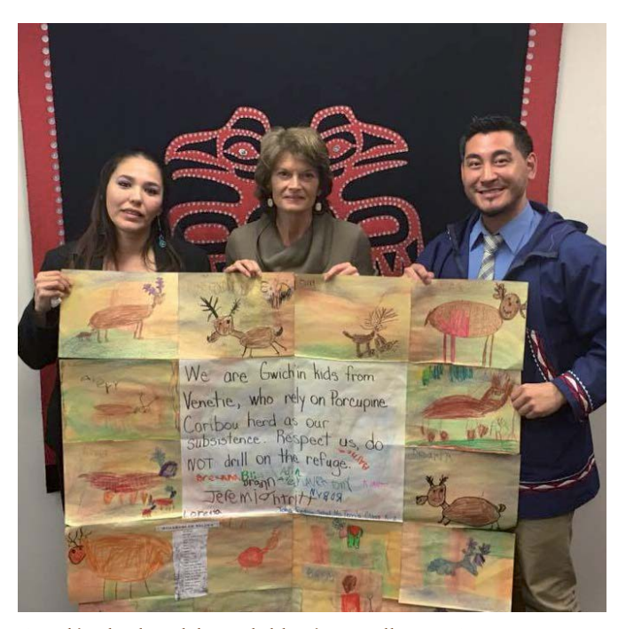
Gwich'in leaders deliver children's art collage to Senator Murkowski of Alaska

The Arctic National Wildlife Refuge is the ancestral land of the Gwich'in and Inupiat people. The Arctic is warming twice as fast as the rest of the world, causing disruption to ecosystems and subsistence lifestyles. Oil drilling in the Refuge is a constant potential threat. The coastal plain of the Refuge is the birthing ground for Porcupine Caribou. Gwich'in people call the coastal plain "the sacred place where life begins." Caribou provide the Gwich'in with food security, as well as cultural and spiritual wellbeing. For decades, the Gwich'in have led efforts to defend the Refuge from drilling, which puts their lives in jeopardy. Because most Gwich'in people happen to be Episcopalian, protecting the Refuge is a high priority of the Episcopal Church. Inupiat people are not of one mind about oil drilling in the Refuge. Some people worry that without the option of oil drilling, they might have to leave their home due to lack of economic opportunity. Until viable plans exist for transitioning away from fossil fuels, many Indigenous communities face morally difficult, divisive, and unfair choices.